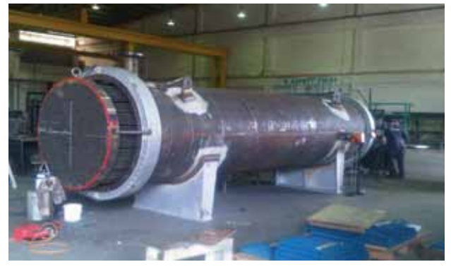
Equipment Tag Number: 16-E-05 Size: 1,350mm ID x 6,096mm LG x 1,818 tubes of 2.11mm Thk MOC: SA516-70N End user: Kaduna Refinery Petrochemical Co