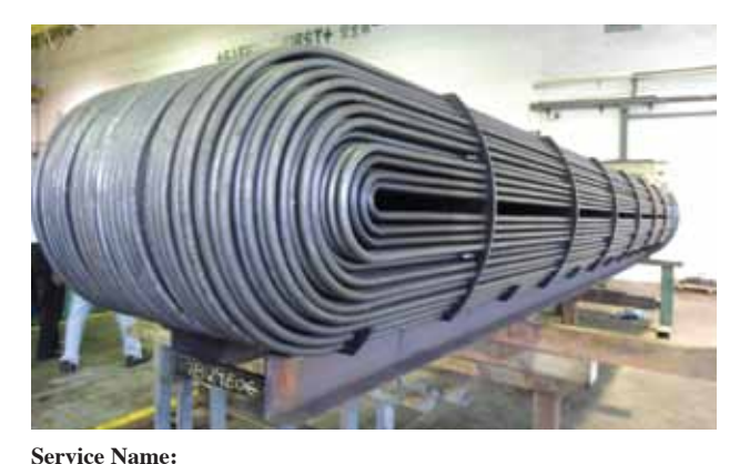
U tube Bundle 957mm OD X 6,038mm L X 388 'U' tubes MOC: SA516-70N End user: Kaduna Refinery Petrochemical Co