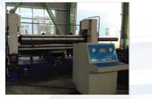
HYDRAULIC ROLLING MACHINE 2500MM X 32MM THK