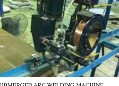
SUBMERGED ARC WELDING MACHINE